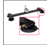
GLASS HOLDER ATTACHMENT